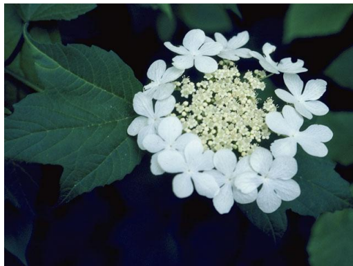
Hydrangea quercifolia Mrs. W. D. Bransford