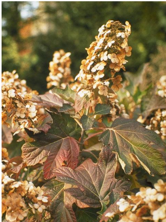
Hydrangea quercifolia Albert F. W. Vick