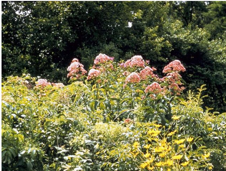
Eupatorium purpureum Albert F. W. Vick

Other: Can get very tall; good backdrop plant