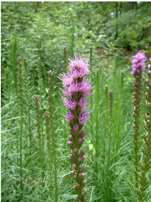
Liatris spicata