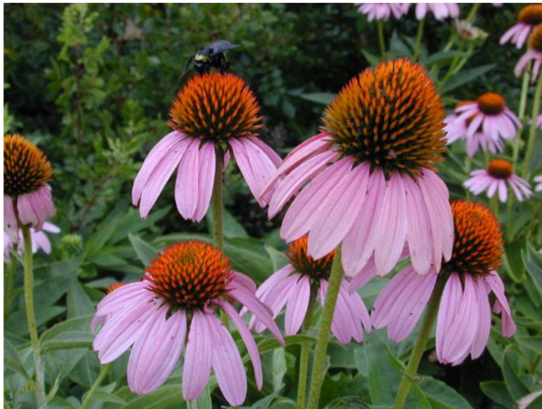
Echinacea purpurea

Other: Allow seed heads to remain at end of season for bird food