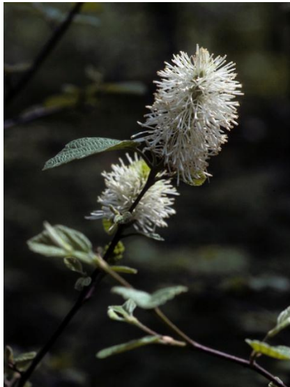
Fothergilla major

Other: Good companion plant for native deciduous azaleas