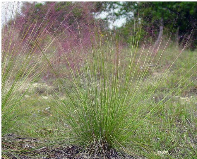
Muhlenbergia capillaris Sam Strickland

Other: Allow foliage and seed heads to remain through winter, but may wish to prune to 6" height in early spring