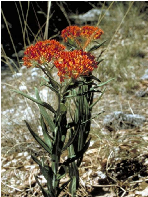
Asclepias tuberosa

Other: Will get aphids that are specific to this plant; they neither endanger the plant nor pose any risk to other plants in the area.