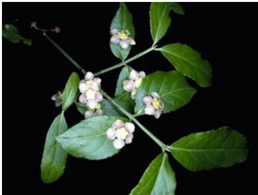
Euonymus americanus flowers Norman G. Flaigg

Other: Evergreen when winters are mild; beautiful seeds and foliage