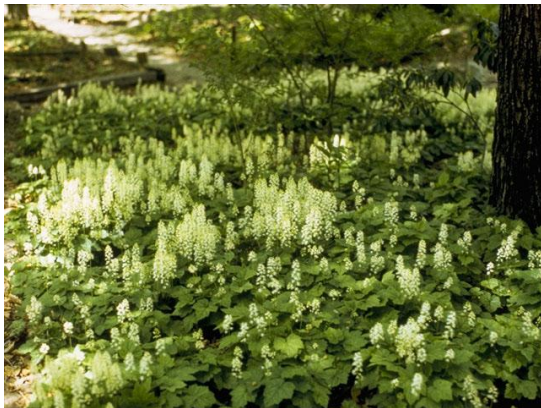
Tiareella cordifolia

Other: May do well at the base of a rock garden or hillside where it is moist; has a tendency to spread and form a low carpet if conditions are ideal