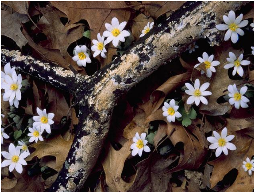
Sanguinaria canadensis Doug Sherman

Other: Attractive foliage after the flowers die back; can spread rapidly and makes a good ground cover