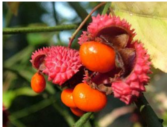
Euonymus americanus seed pods Stefan Bloodworth