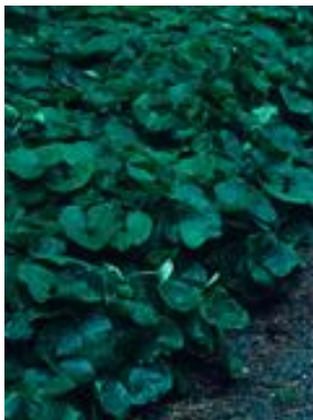
Asarum canadense Sally and Andy Wasowski

Other: Has extremely attractive foliage and makes an excellent ground cover; rhizomes can be used as a ginger substitute