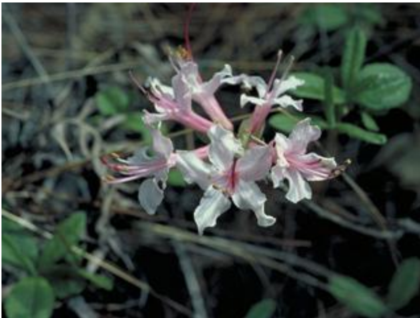
Rhododendron periclymenoides W. D. Bransford

Other: Deciduous; all plant parts are poisonous