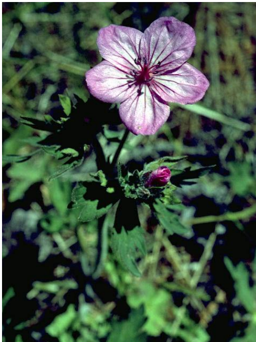
Geranium maculatum Mrs. W. D. Bransford