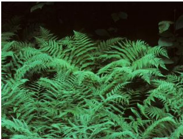
Dryopteris marginalis