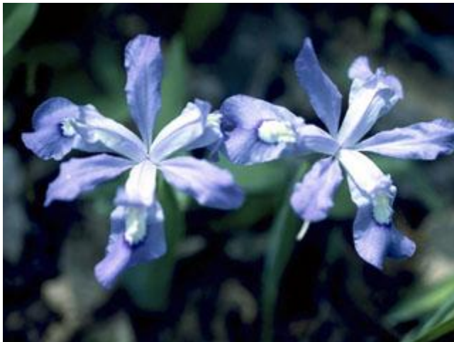
Iris cristata Mrs. W. D. Bransford

Other: Tends to spread with time; Iris verna is another small woodland iris native to the mountains of North Carolina