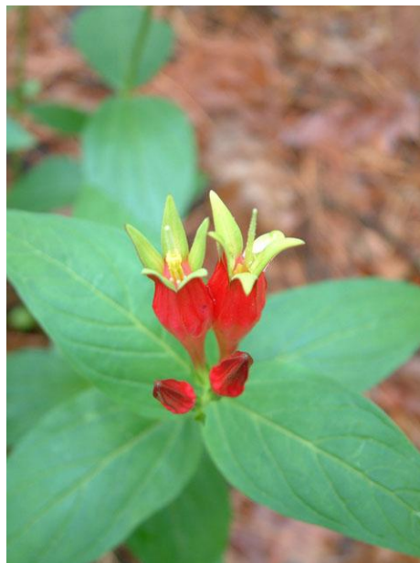
Spigelia marilandica